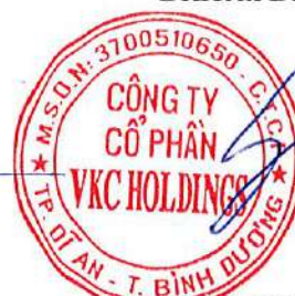
PHAM HOANG PHONG

30312 CÔNG CHÍNH TỔNG CHỦ S - TP. 05106 CÔNG TY CỔ PHẦN HOLDING T. BÌNH