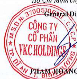
PHAM HOANG PHONG